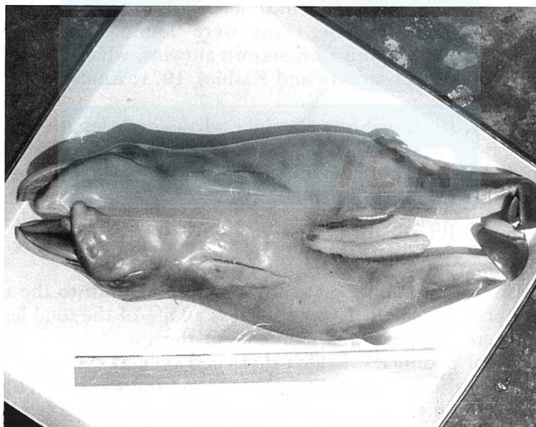
Fig. 2. Minke whale Siamese twins (abdominal side).