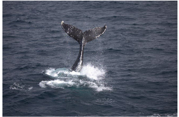
Humpback whale striking the water surface with its tail fin.