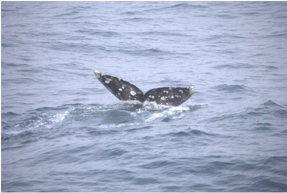
Gray whale diving with its tail fin up.