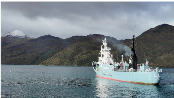
Yushin-Maru No. 2 leaving Dutch Harbor.