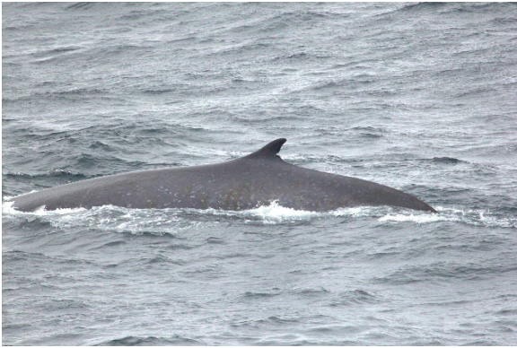
Fin whale showing its dorsal fin.