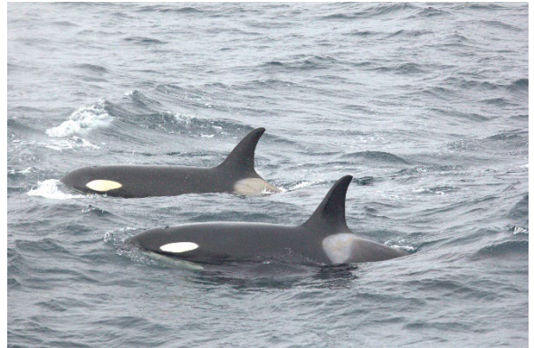
Group of killer whales.