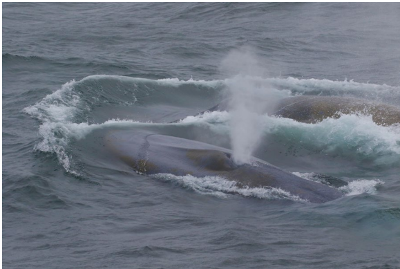
Blue whale breathing at sea surface (2022)