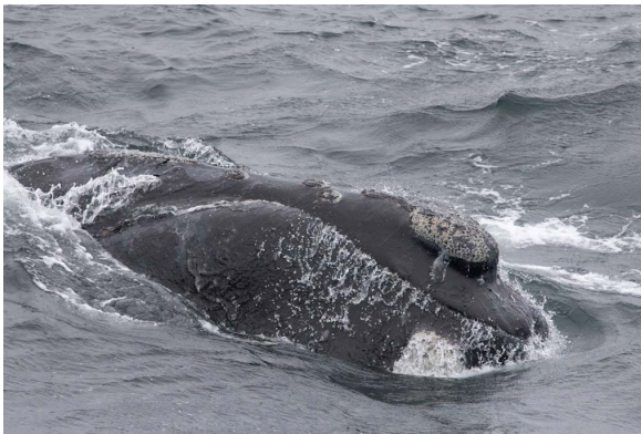
Head of a rare North Pacific rare whale (2023)