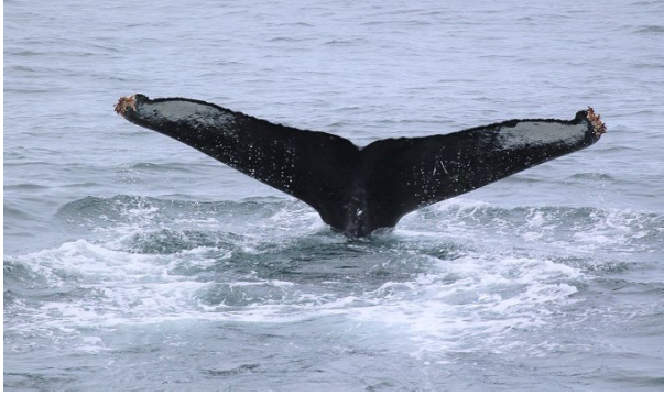
Caudal fin of a humpback whale photographed near the Aleutian Islands (2022)