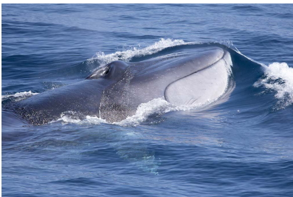
A fin whale surfacing. The right lower jaw is white (2023)