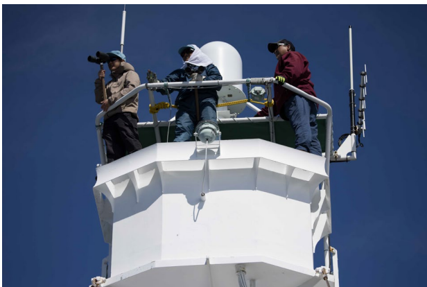
Observers and international researchers confirming whale species from the observation platform (2023)