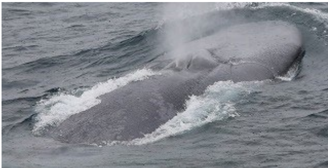
A blue whale breathing at the sea surface.

Photographs from the 2021 IWC-POWER cruise