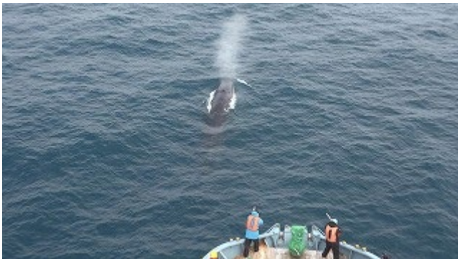
Fin whale biopsy sample collection and attachment of the diving behavior data logger.