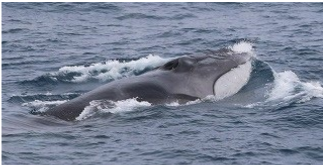
Fin whale coming to the surface.