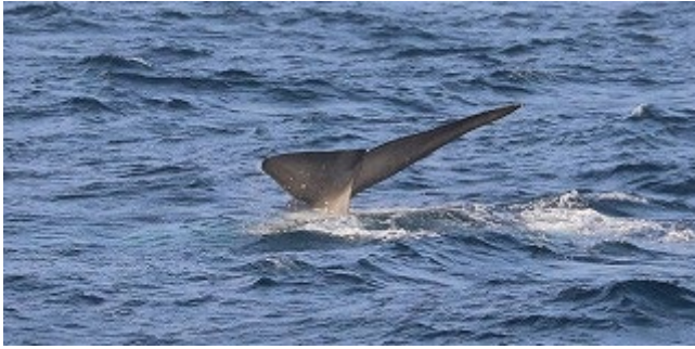
A blue whale shows its fluke and dives.