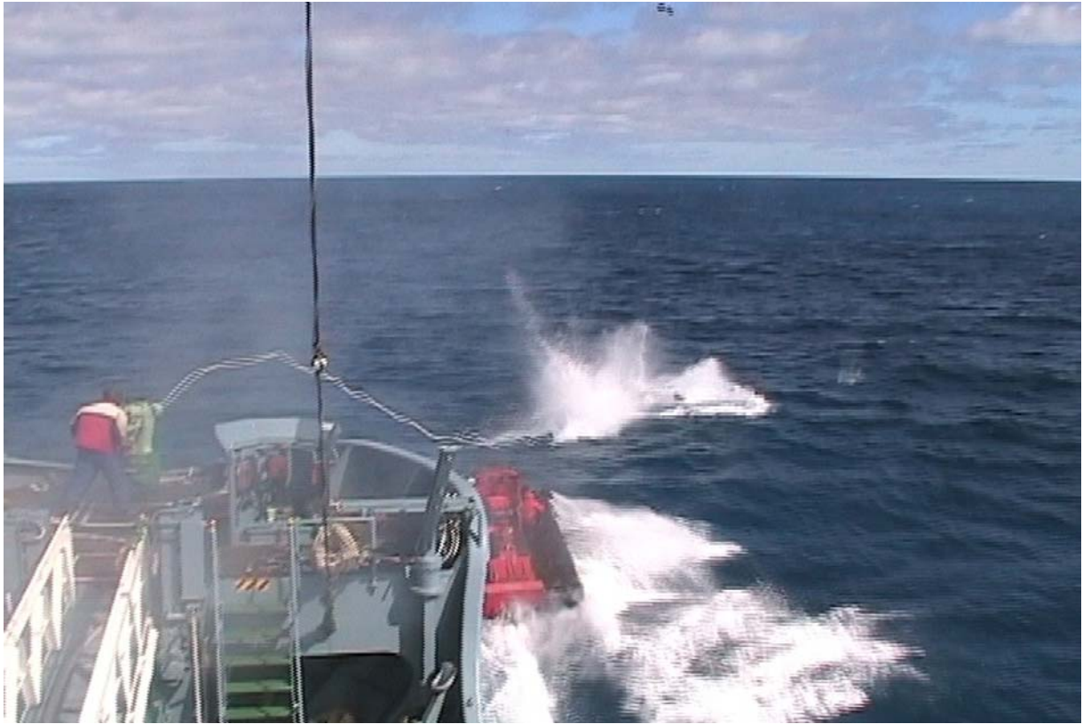
(2) The next instant, a Greenpeace inflatable boat rushes towards the harpoon rope.