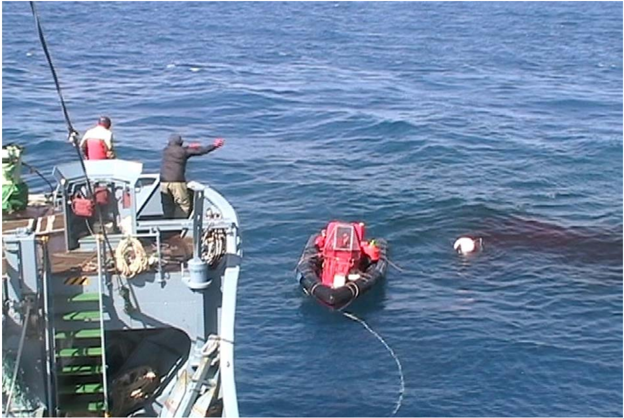
(5) Activists ignore gestures from Yushin-Maru No. 2 crew urging them to quickly disentangle their boat. They seemingly were trying to cut off the rope.