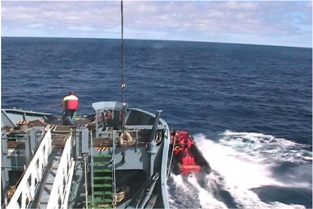
(3) Immediately after, the Greenpeace boat becomes entangled in the harpoon's rope.