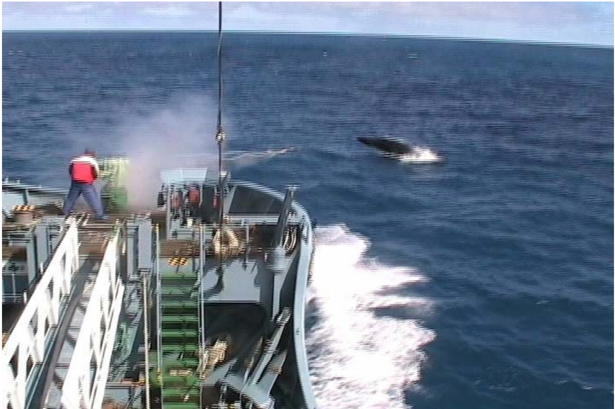
( 1 ) Sampling vessel Yushin-Maru No. 2 harpooning a minke whale. Note Greenpeace inflatable to the right of the bow, purportedly hiding from the harpooner's angle of view.